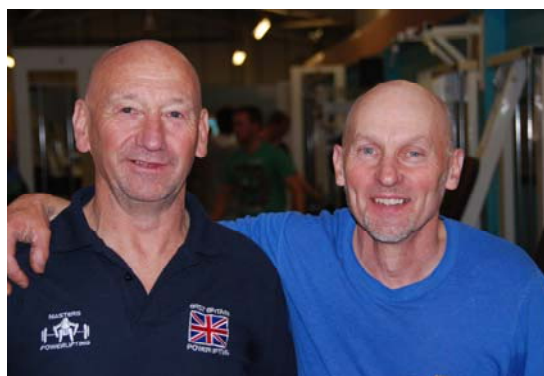
Combined age of around 220!!