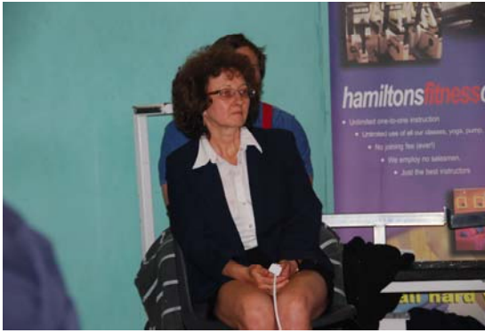
Jenny caused an internet sensation by sitting opposite the live streaming camera!!